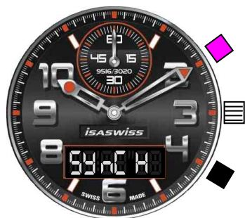
Push A Small second hand runs

From each mode, push the crown at least 3 seconds. Movement is going into synch mode for adjust and synchronize the hands position.