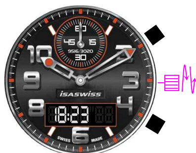
Turn up or down the crown to set hour, the display will follow hands

From each mode, pull the crown. Movement is going into time setting mode. The small second hand stops.