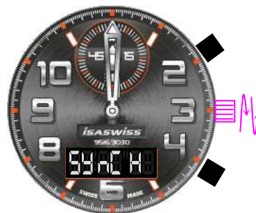
Turn up or down the crown Minute hand runs