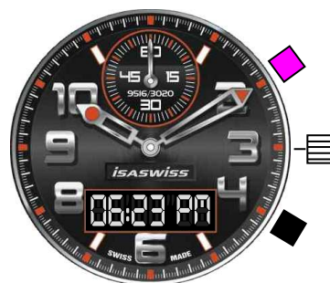
Push A changes between 12h/24h mode